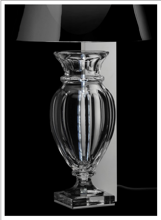
INNER BODY POLISHED ALUMINUM